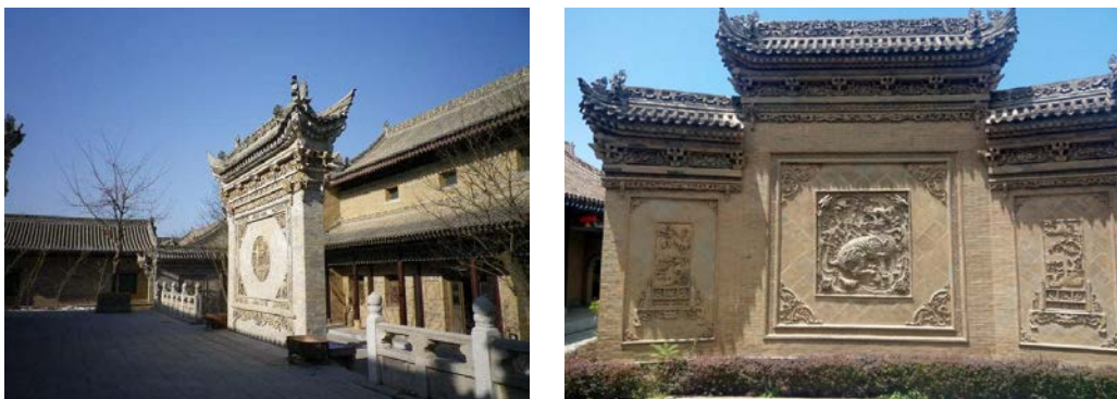
Figure 3. Architectural decoration in folklore villages of Guanzhong area