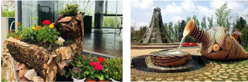
Figure 4. Landscape sketches in folk villages

landscape of folk villages. Products, these objects inherit the local culture, each instrument is a history, but also very good to arouse the memory of tourists to rural life, produce love for rural life.