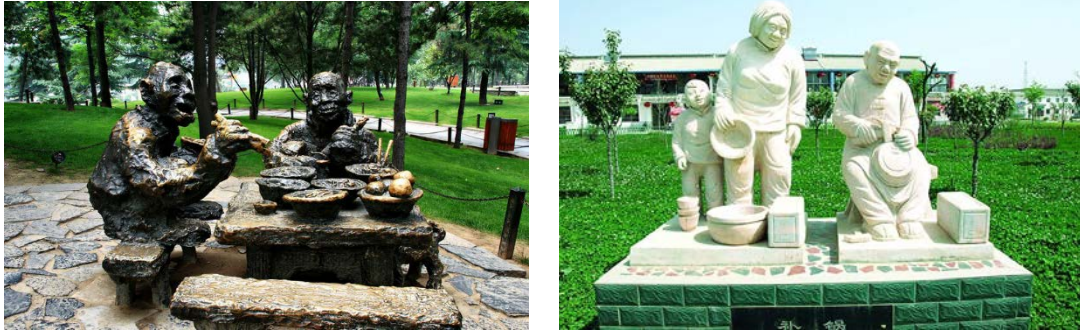
Figure 2. Local cultural landscape sculpture based on local life